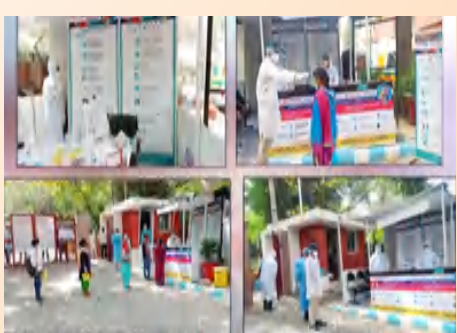
Set up of flu corner for screening to all suspected cases of Covid-19 of V.P.C.I.